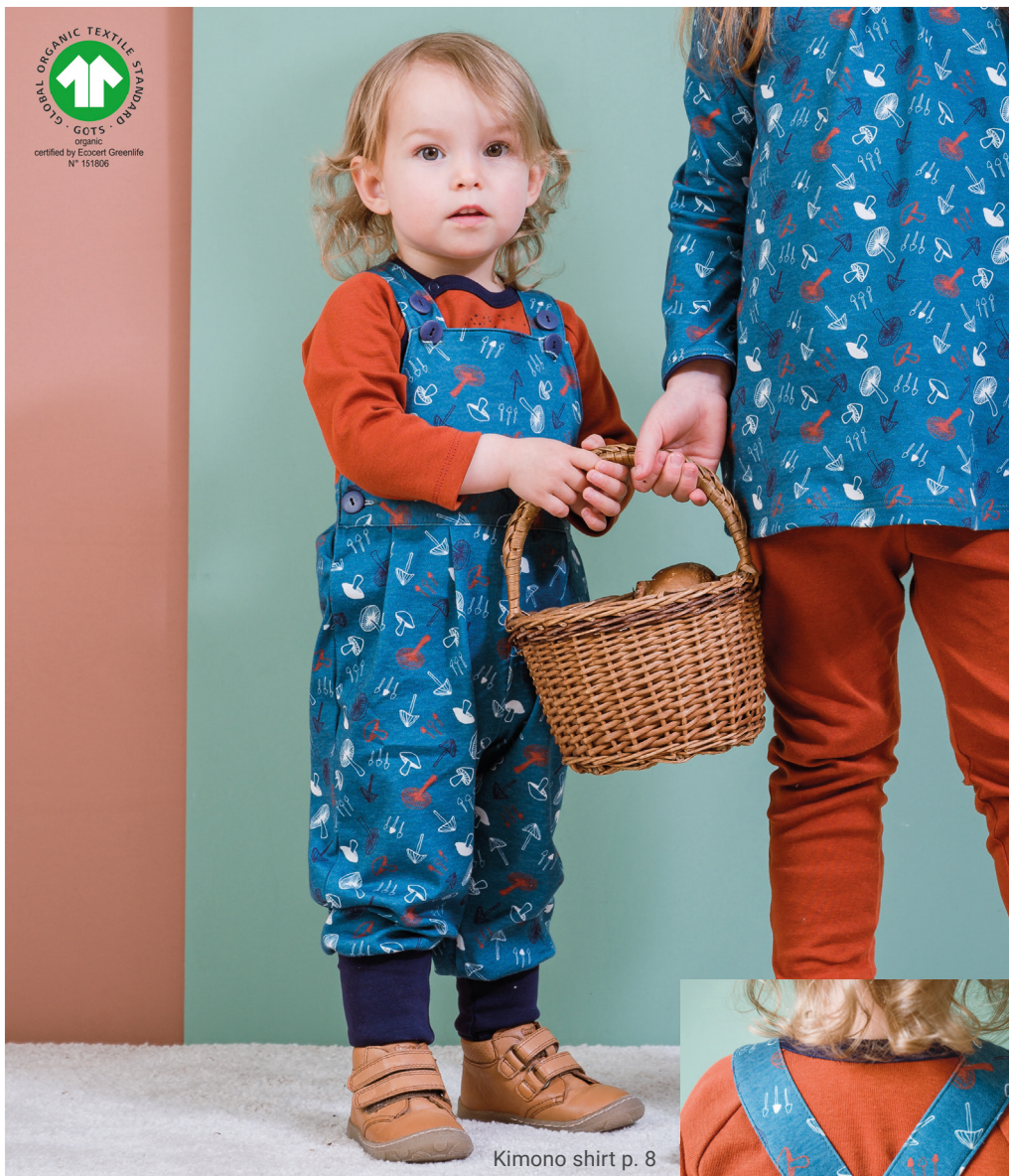
Kimono shirt p. 8