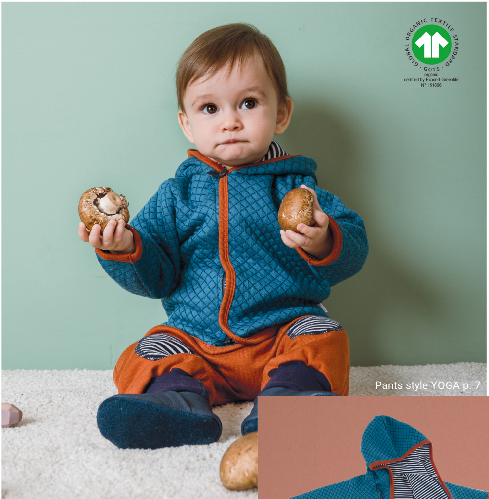
Pants style YOGA p. 7