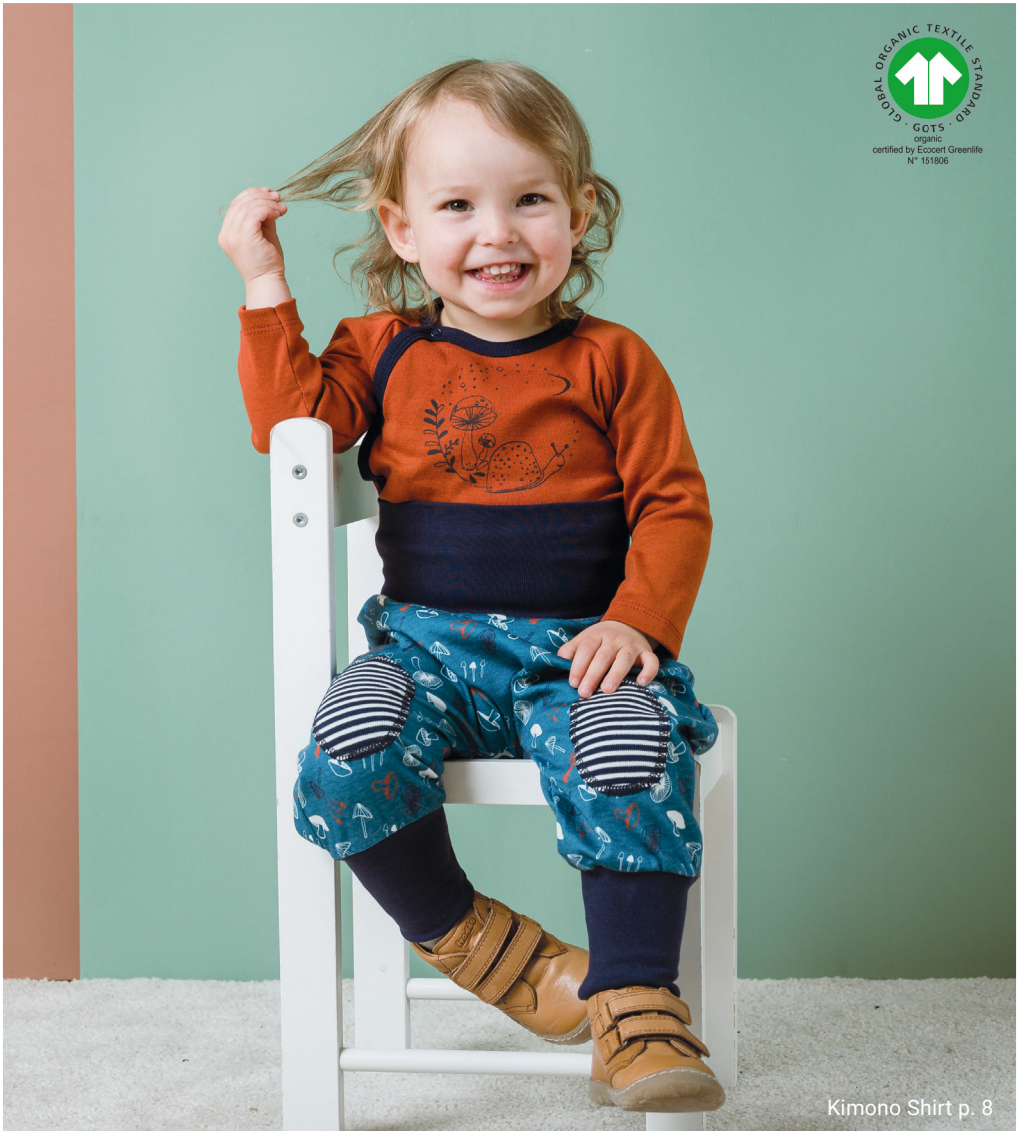
Kimono Shirt p. 8