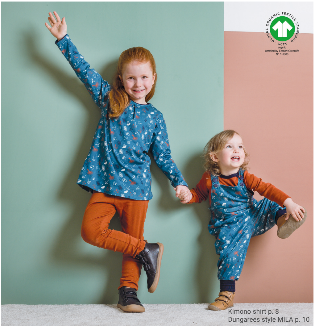
Kimono shirt p. 8 Dungarees style MILA p. 10