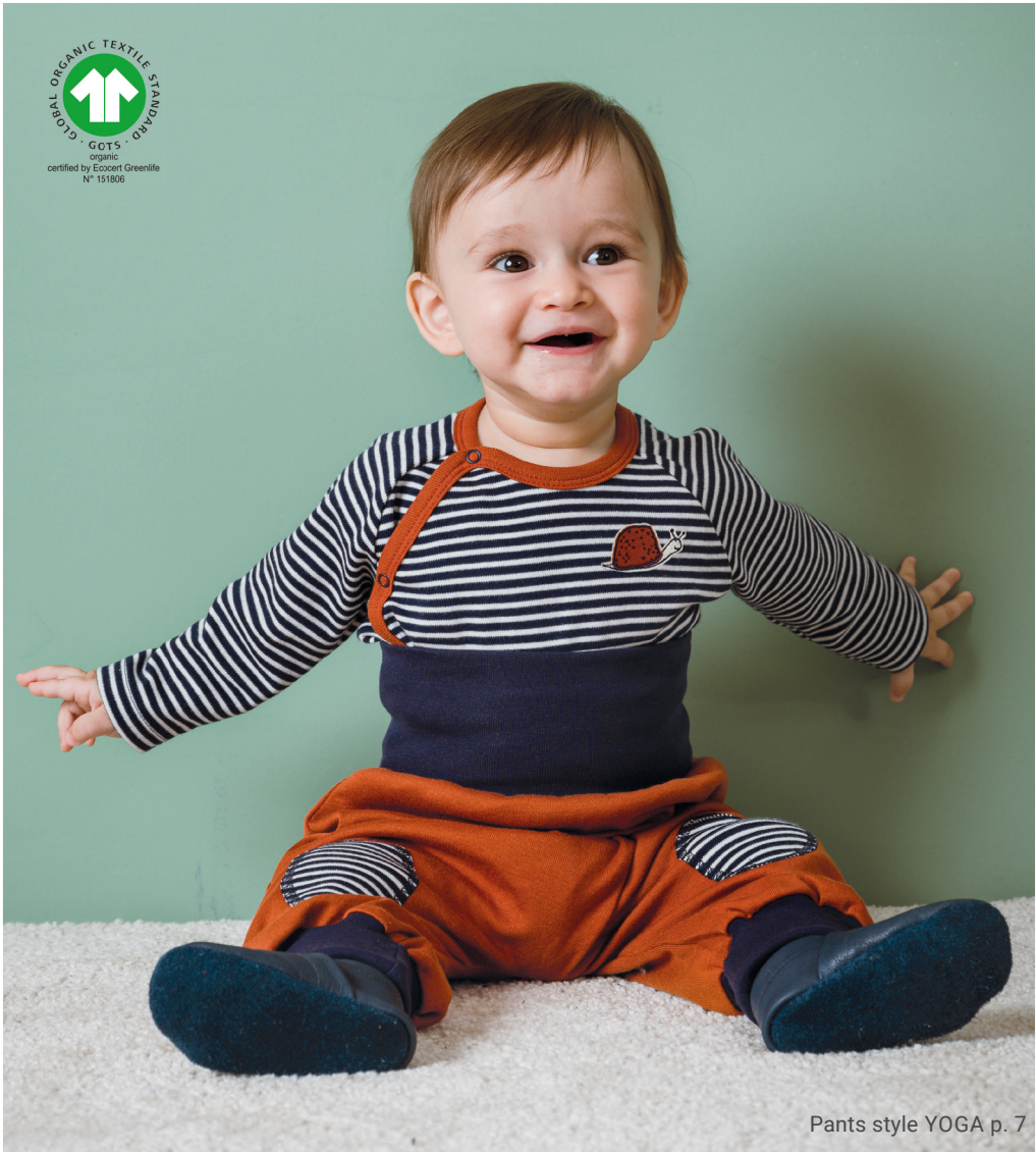
Pants style YOGA p. 7